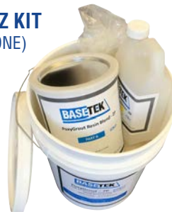
GROUT EZ KIT (ALL IN ONE)