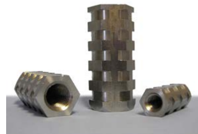
FIELD INSTALLED THREADED INSERT KITS