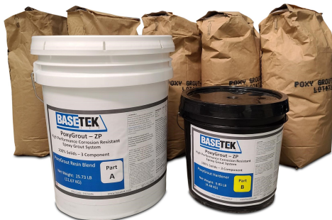
5 BAG GROUT CONVENTIONAL SYSTEM